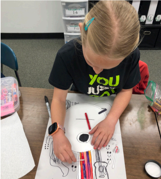
EXHIBIT LESSON: MAKE YOUR MARK